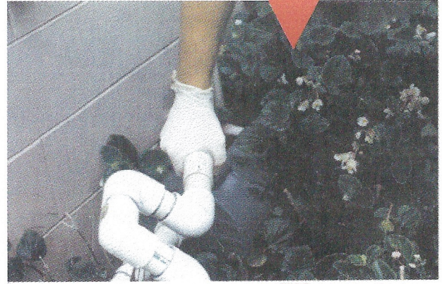
5. Tighten Layers of POW-R WRAP