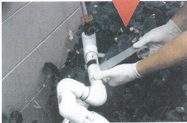
3. Apply Plug Over Break in Pipe