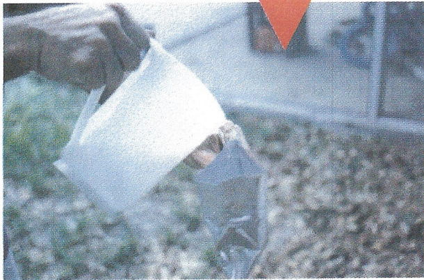
2. Activate POW-R WRAP