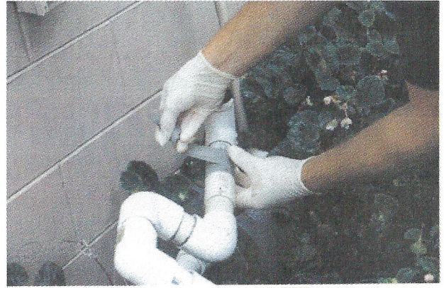
4. POW-R WRAP Damaged Area