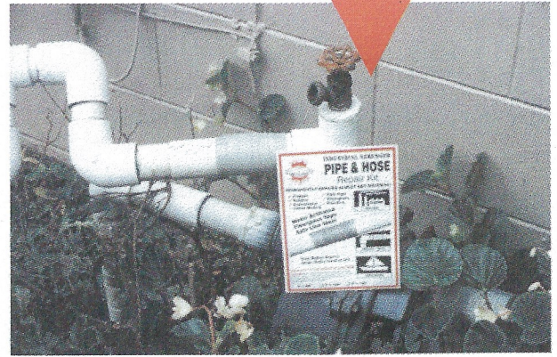
6. Repaired With POW-R WRAP